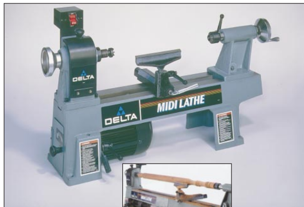
Delta Midi Lathe with extension

DEL46-250 DELTA MIDI LATHE ..... $309.95 UPS $30